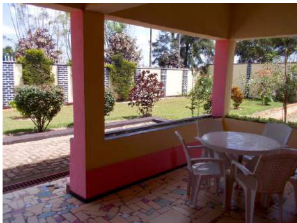
Figure 3 Terrace to the garden