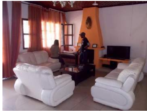
Figure 2 The livingroom with piano