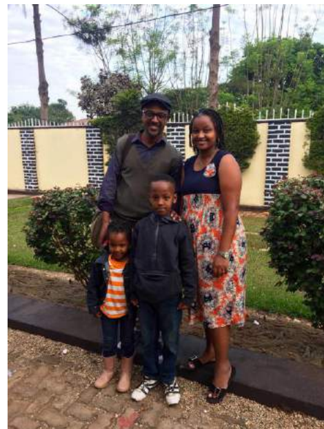
Gaston, Florida, Gisa and Gwiza 1